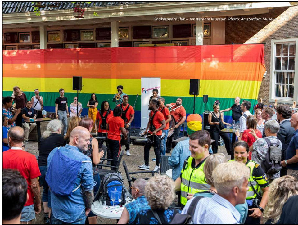
This photo was taken a month ago at the Amsterdam Museum. For the whole week of pride, activities and events were organized by LGBTQI+ organizations and communities at and with the museum, in a sort of week-long “museum takeover”