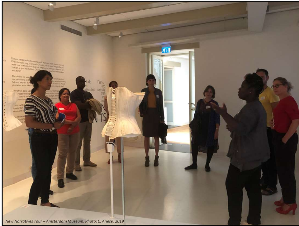
New Narratives Tour – Amsterdam Museum.

The Amsterdam Museum has been organizing New Narratives tours, inviting external persons such as writers, journalists, politicians, and others, to give guided tours to the public. What do they notice? What stories would they tell? What is missing in the museum?