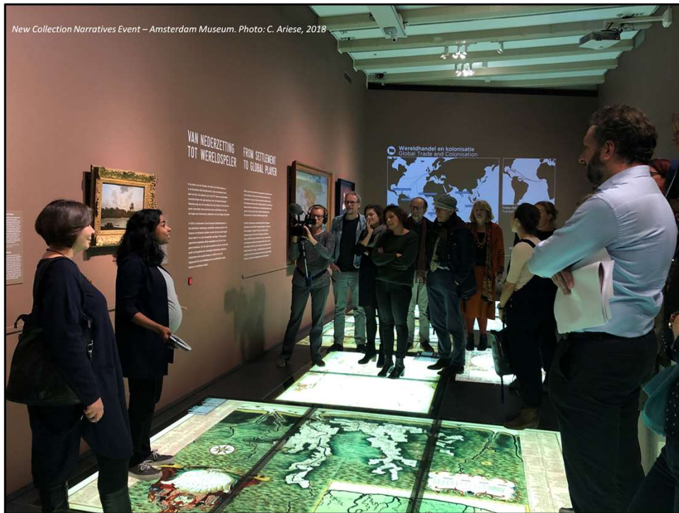
New Collection Narrative Event – Amsterdam Museum.

Beginning last year, the museum also created New Collection Narrative events where the focus is on a single object from the collection from multiple narratives. How is this painting of a plantation framed in the current exhibition? What labels used to accompany it? What could the museum say about this in the future – and how?