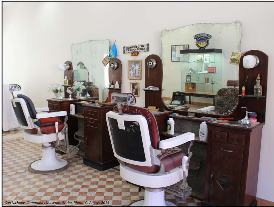
San Nicholas Community Museum, Aruba.

On Aruba, the San Nicholas Community Museum is a grassroots initiative to collect local, recent histories that were fading from living memory. It is an important resource for local children who can see and value the history of their own town and ancestors.