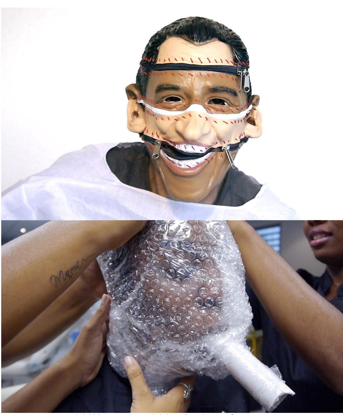
Utopie de la libération / Fabrique de la beauté

If decolonial discussion is impossible between two incompatible postures, it is nonetheless unavoidable for the construction of a future that will be common, for better or worse. In order to establish footbridges of understanding, cultural and affective movements are indispensable.